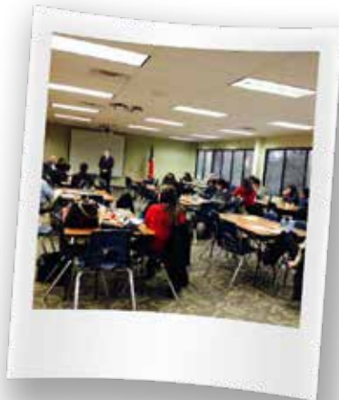
Training Forum on Substance and Alcohol Abuse for North East Independent School Teachers, and Family Specialist!