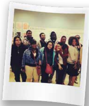
Focus Group on determining effective messages for Youth Substance Abuse!