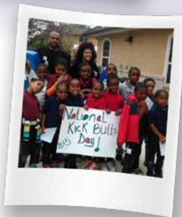
Oak Manor Apartment Housing and Community Services, Inc. National Kick Butts Day Event 2015 #KickButts