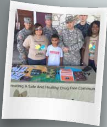
Bethel Prevention Coalition Prevention Prophets working at the Prescription Drug Take Back event together with the DEA and Cowboys Dance Hall.