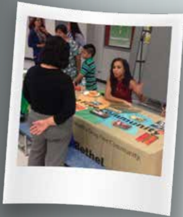
Building Capacity taking DFC into Montgomery Elementary School outside our target area.