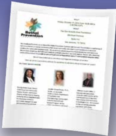
1st Annual DFC Faith Summit